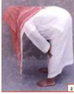
Bowing ( rukoo' ) Position in Salah

(iii) While in bowing position one says: