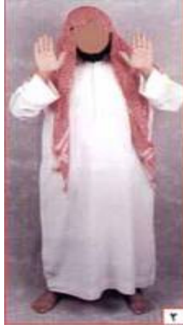
Standing Facing Qiblah and Making Takbeer with Raised Voice

3. Place the right hand over the left on the chest. Look at the place of prostration without lowering your head.