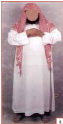
Hands on the Chest; Right Hand over the Left

3. Place the right hand over the left on the chest. Look at the place of prostration without lowering your head.