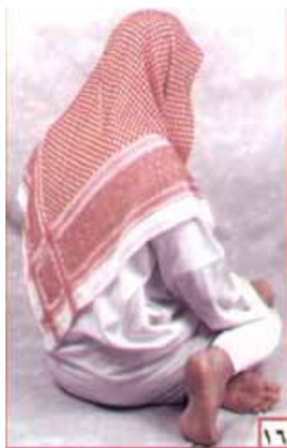
Tawarruk Position -

In the prayers of the three or four rak'ah type, after finishing the second rak'ah and the first tashahhud , stand up raising your hands (as described earlier) and say, "ALLAAHU AKBAR." When you reach the straight standing position, recite the Faatihah and go for the prostrations as done earlier. If you are praying the three rak'ah prayer of Maghrib sit with your body resting on your left thigh, your left leg under your right, while keeping your right foot upright. This position is called tawarruk :