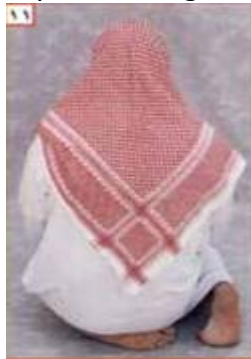
Sitting Position -